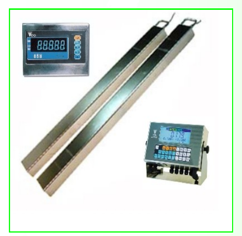
500 – 3 000 Kg

Add a 3rd (4th) and weigh very long bars, sizable objects etc. Ideal as a "weighing module" in material handling systems. Basic weighing indicator with many functions