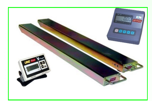
5 g – 2 000 Kg